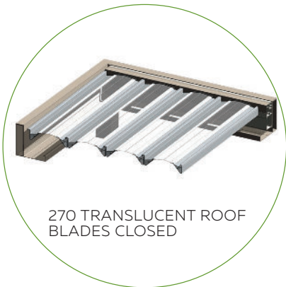
270 TRANSLUCENT ROOF BLADES CLOSED