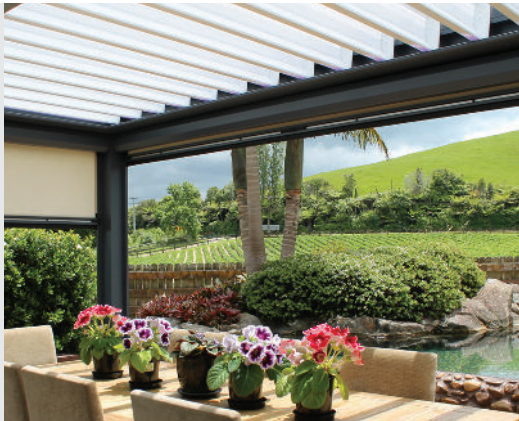
STRAWBERRY FIELDS, CLEVEDON, NZ